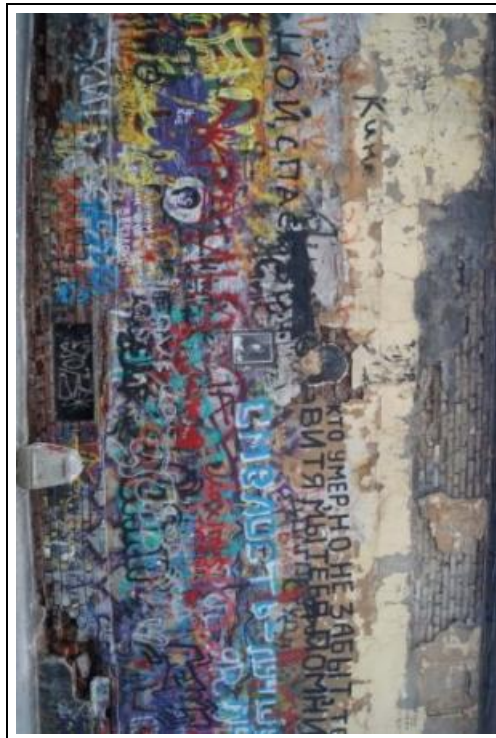
Filesize: 1.79 MB