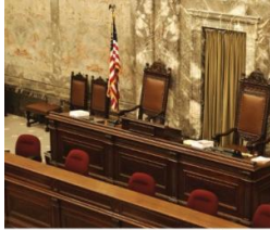
CRS Report for Congress: The Department of Housing and Urban Development (HUD): FY2006 Budget: August 1, 2005 - RL32869